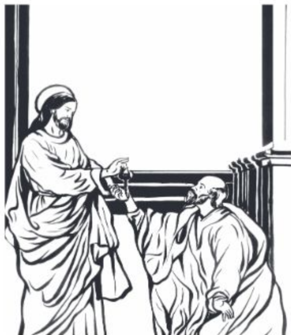
Jesus is handing over the key of the Kingdom of Heaven to Peter

While the judgement of Jesus was going on in the pillat building, Peter denied three times in response to the question of a maid servant. It revealed that Peter still had a weak faith on Jesus. Jesus once questioned Peter for purifying his faith, "Peter, do you love me?" Jesus asked Peter this same question three times. And Peter answered three times, "Yes Lord, I love you." In response, Jesus told, "Take care of my sheep." (John 21: 15-17).