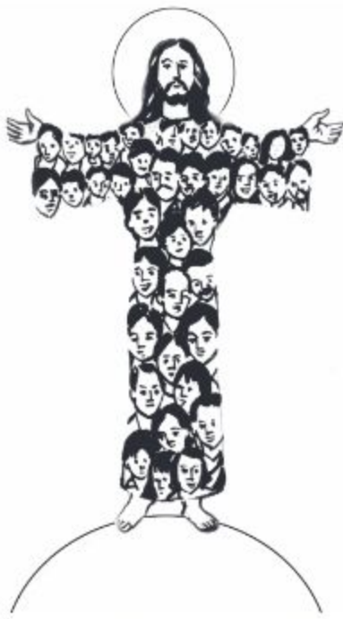
Christ is the head of church

Task: Show a relationship of the works of the head you have found in group discussion with Christ as the Head of the church.