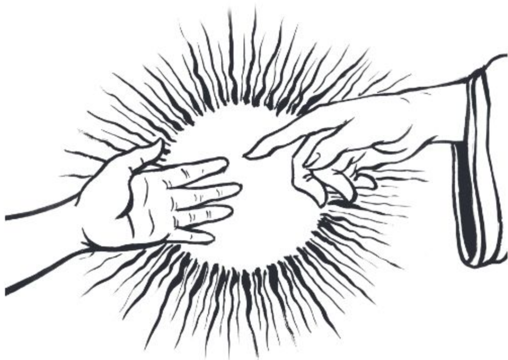
Union of God and Man

In the book of Genesis the description of creation shows that God has created everything one by one. After each day's creation, God looked at them and saw everything was good. On the fifth day He said, "Let us make man in our image, to our likeness" (Gen 1 :26). So God created man in His image. He gave them power to rule over everything.