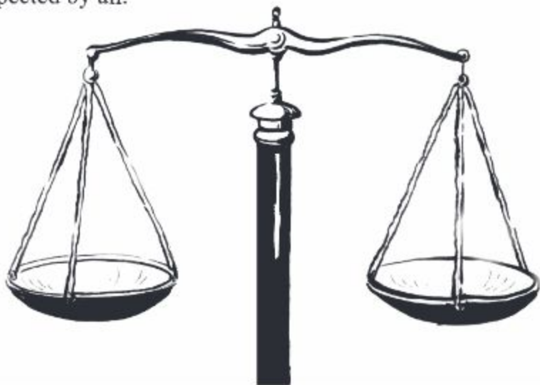
The balance is the symbol of justice

We need a Christian society enriched with human, moral and religious virtues in the age of flourishing human civilization and globalization. Justice is a need for a universally global community on Christian faith for living a life as shown by Jesus and through building model Christian family. We must co-exist with all others for building the society of justice, for the need of peaceful life leading and for this, self-control must be demonstrated among all. If we grow with these virtues, our personal lives and societal environment would be full of happiness, which is expected by all.