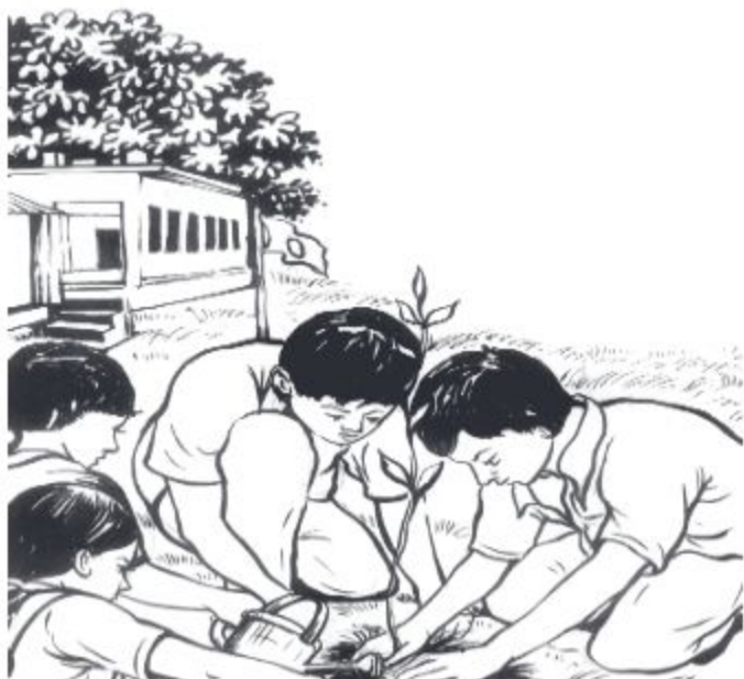
Planting trees is the sign of love for creation

After He created all things "God created man in image; in the image of God Himself, man was created; male and female he created them". He saw everything was very good. By creating human beings, God revealed His own glory. He established friendship with them. Therefore, they can love and know Him.