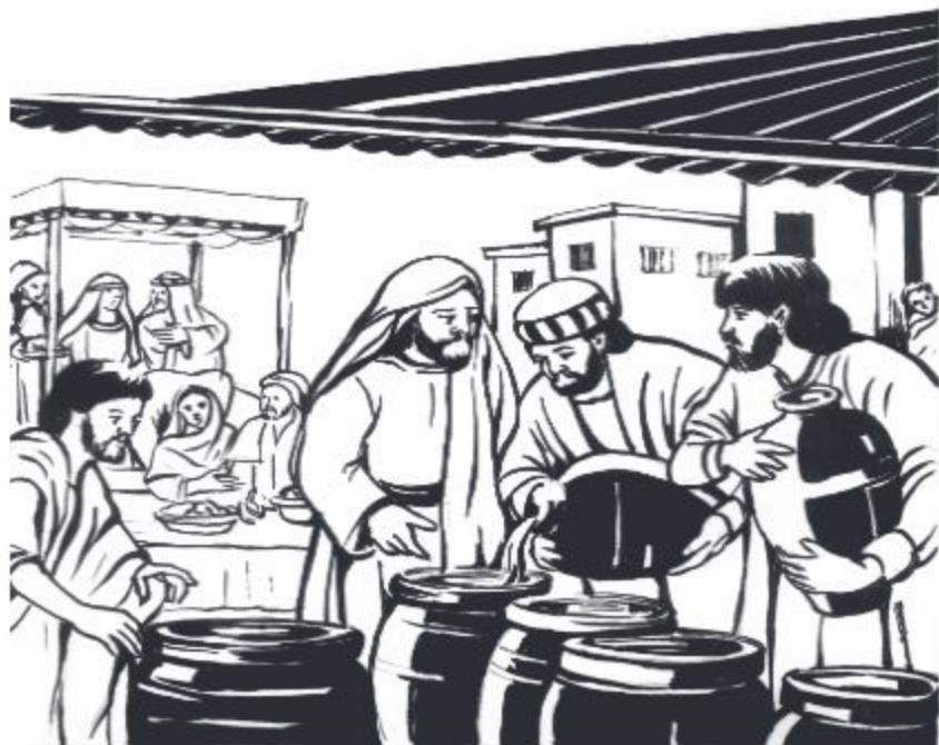
The first miracles of Jesus at the wedding house in Cana

We know about the miracles of the Lord Jesus. We also know that, Jesus Christ has revealed the existence of the Divine Kingdom by His miraculous works. In this chapter, we would learn deeper knowledge about the Divine Kingdom and play the active role in spreading the Divine Kingdom.