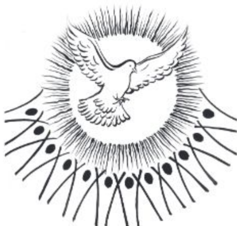
Twelve Benefits of the Holy Spirit

Similarly God has given us the power to do many welfare, like spreading the gospel, healing the ill, bringing the sinners back to the honesty and so on. By all these, we remain connected spiritually with God. Moreover, we remain in the bond of love and grow in love and welfare. All of these are gifts of the Holy Spirit. He flourishes in different ways in different souls.