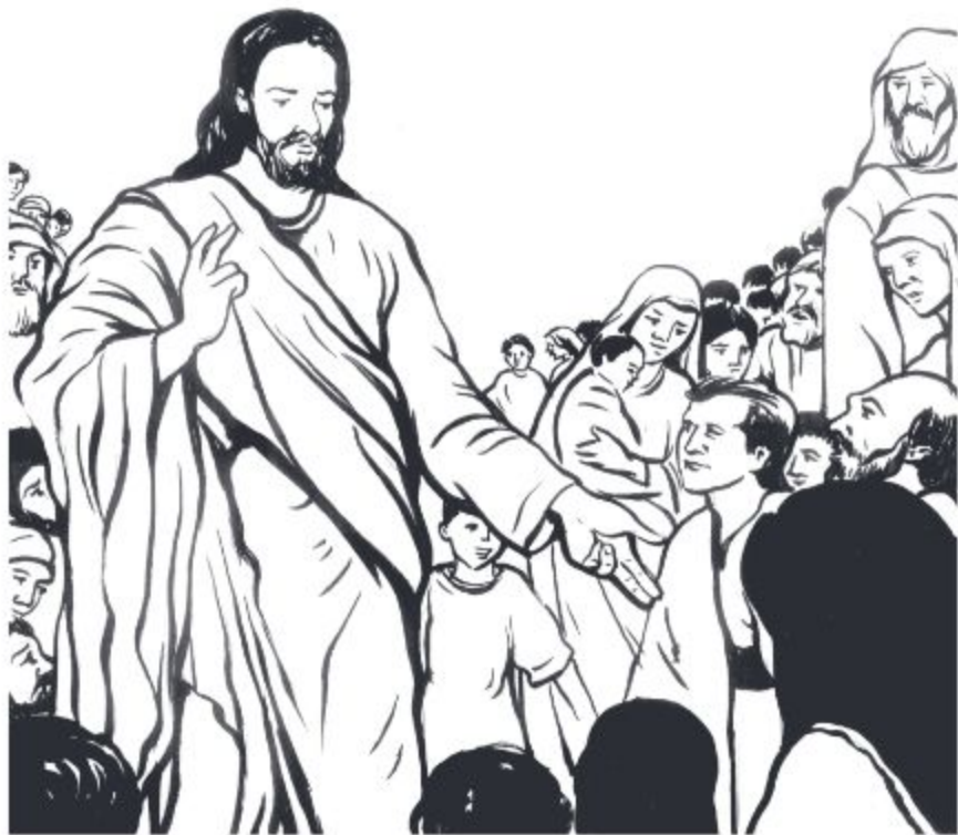
People gathered around Jesus

Jesus came to this world to redeem the human race according to the plan of His Father. Through His preaching and miracles, Jesus taught various things. His teachings have the direction to lead a life of beauty, truth, equality, justice, peace and love. Through His words, He prepared man for redemption. This chapter will highlight the original essence of the words of Jesus.