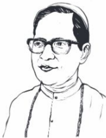
Theotonius Amol Ganguly, the Servant of God